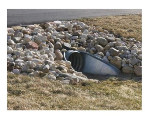
Above – Nicely done Correct slopes Correct culvert and apron Correct vegetation/landscaping No Oversized Rocks