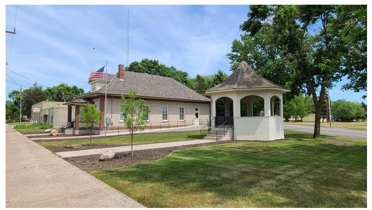
2020 Photo of Becker Township Hall. From left to right, American Legion (old Fire Hall), Becker Township Hall, Gazebo