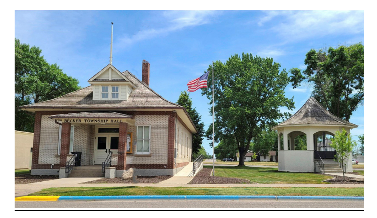
Electric poles and such were edited out.